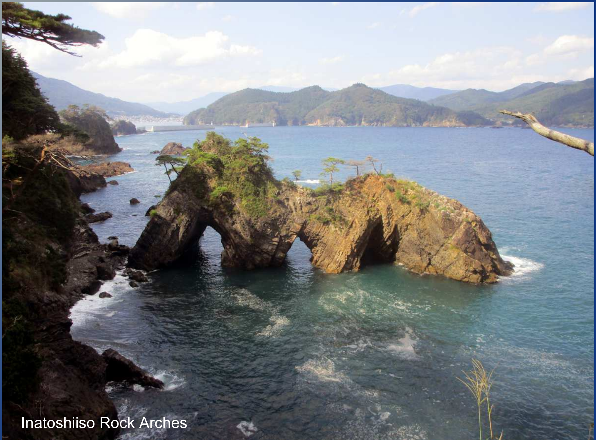
Inatoshiiso Rock Arches