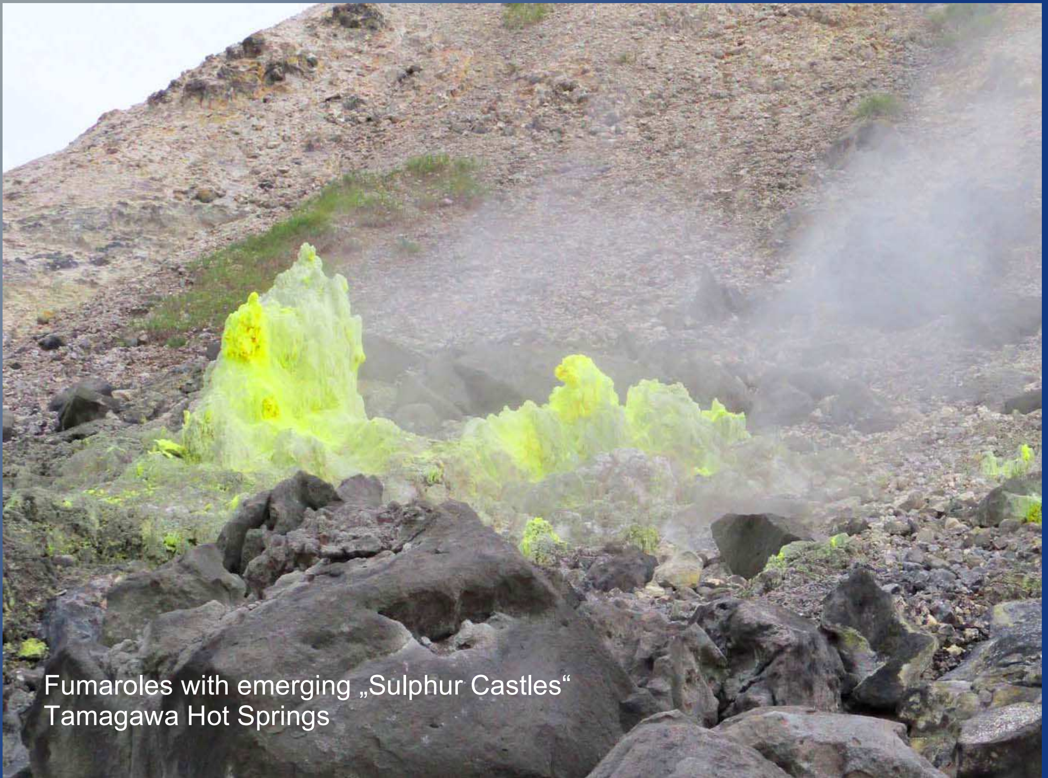
Fumaroles with emerging „Sulphur Castles“ Tamagawa Hot Springs