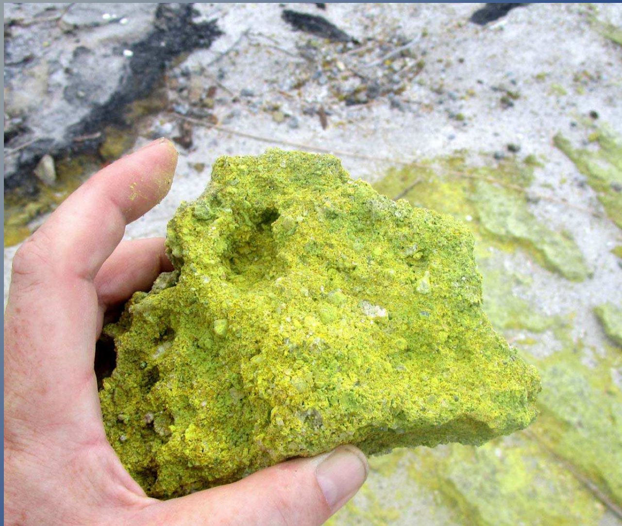
Recent formation of orpiment (yellow) and realgar (orange) in beach sands with gold content around 10 grams per ton