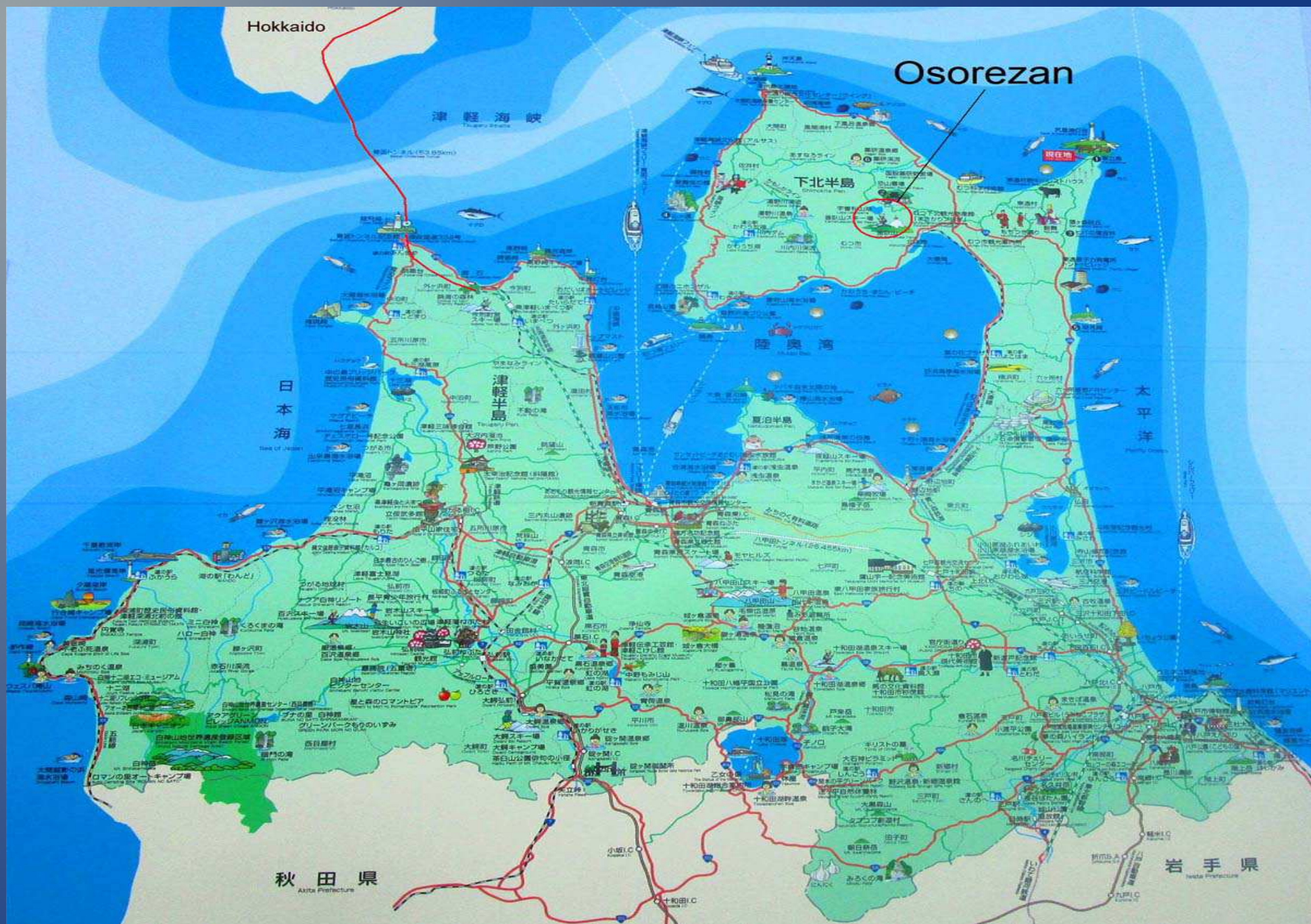
Map of Osorezan on the Shimokita Peninsula / Northern Honshu