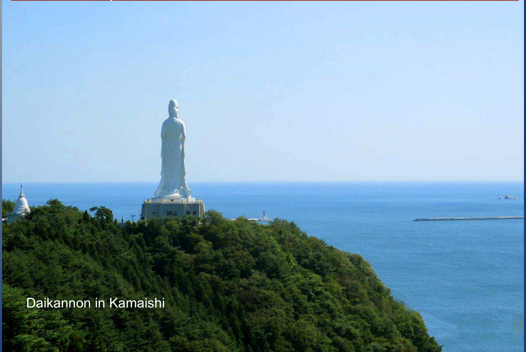
Daikannon in Kamaishi