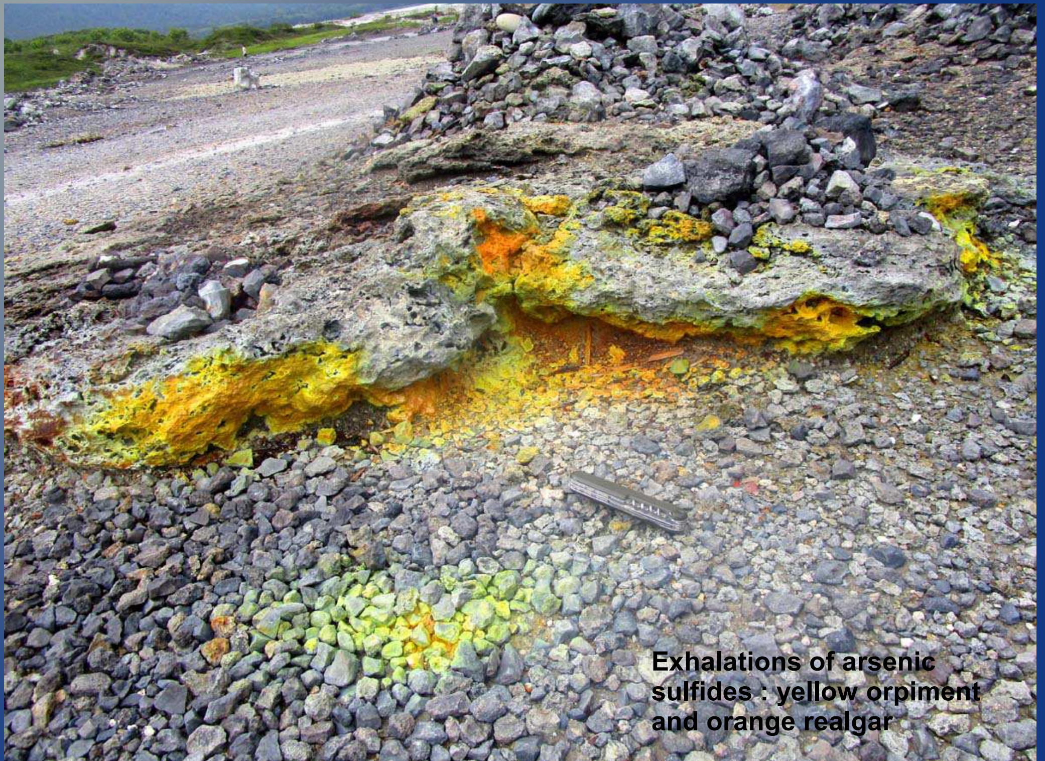
Exhalations of arsenic sulfides : yellow orpiment and orange realgar