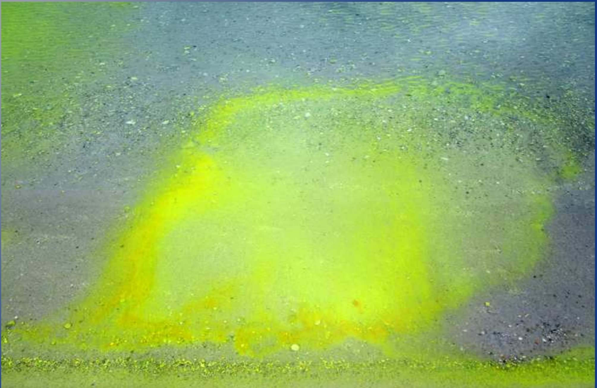
„Picassos“ - bright yellow orpiment underwater exhalations along the Osorezan lake shoreline