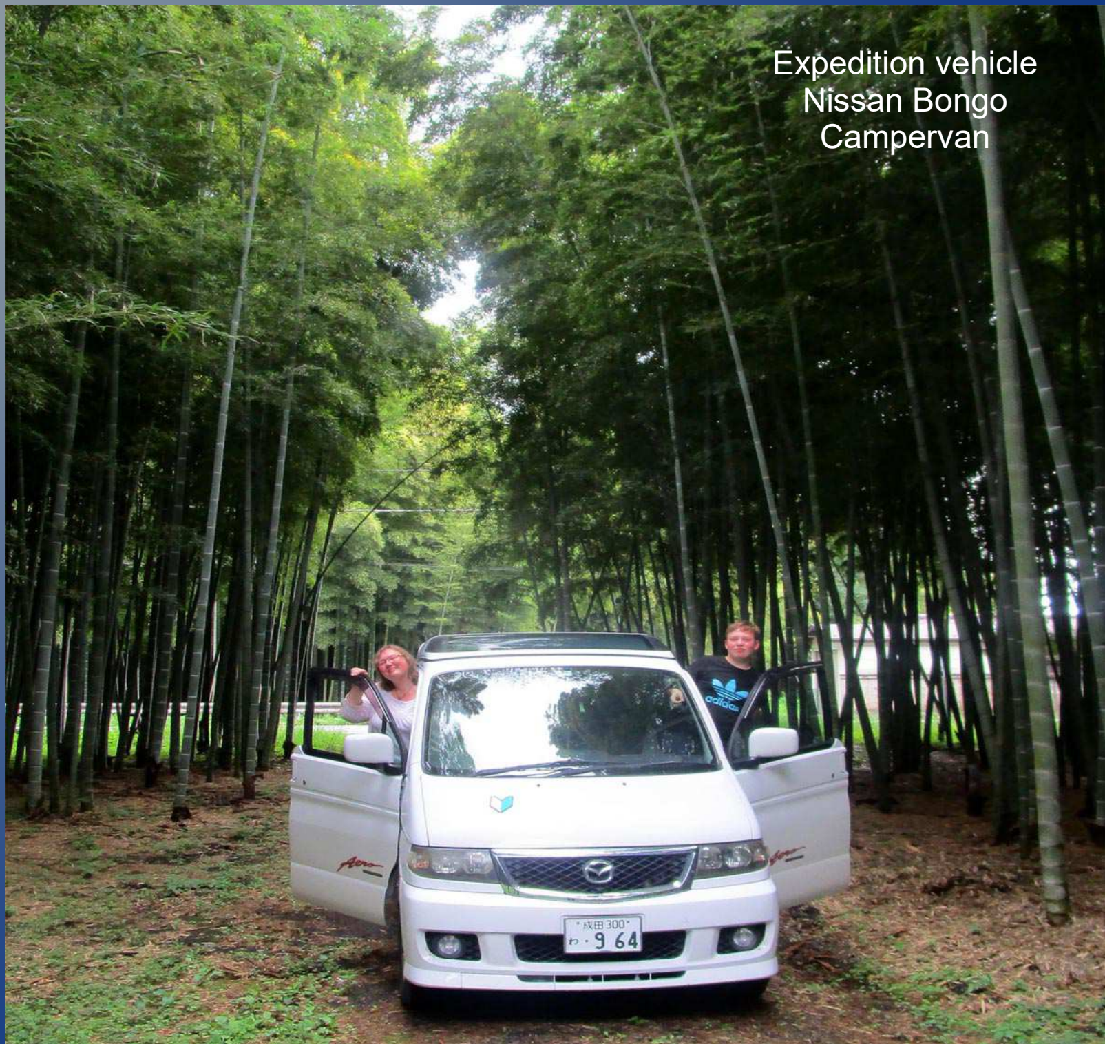
Expedition vehicle Nissan Bongo Campervan