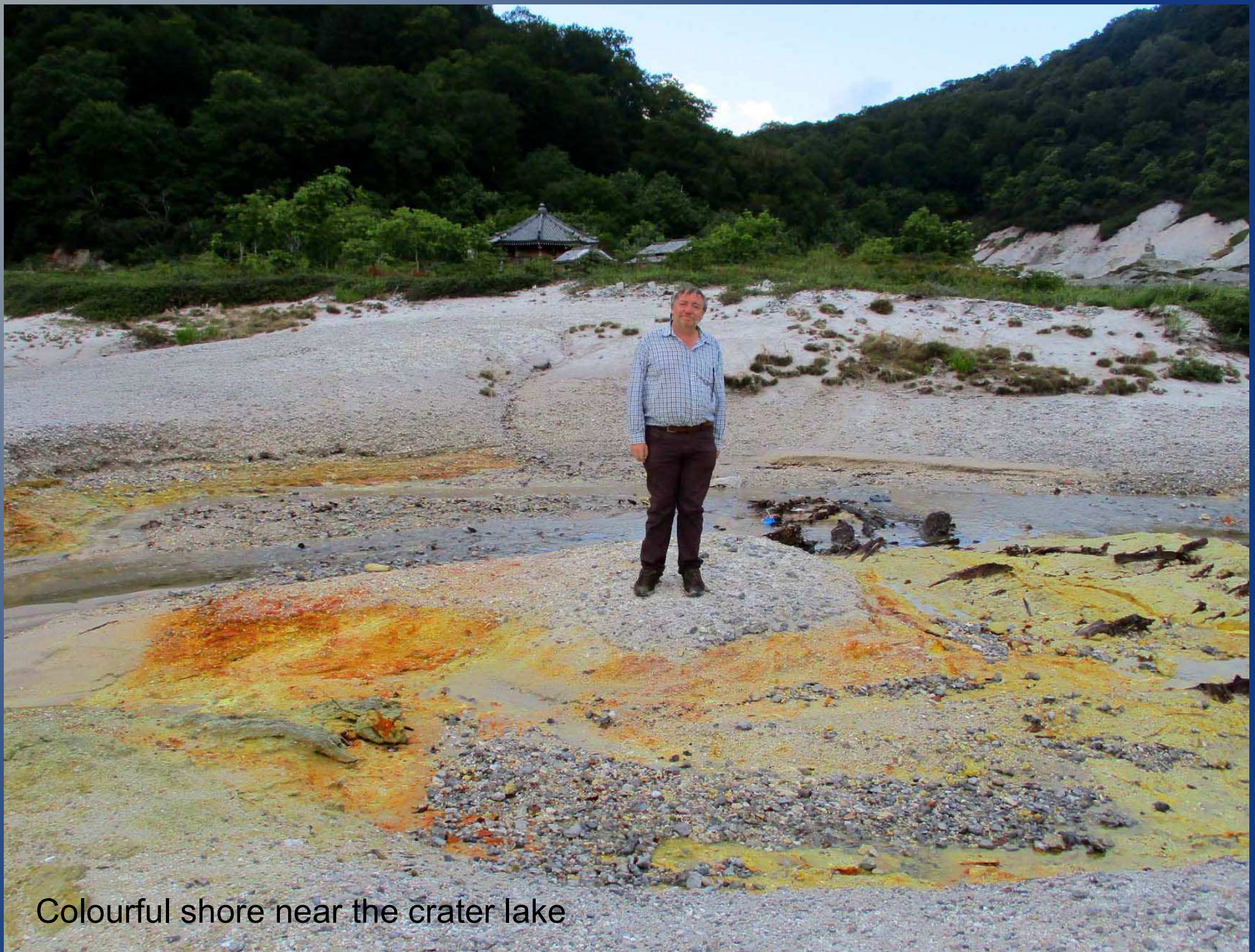
Colourful shore near the crater lake